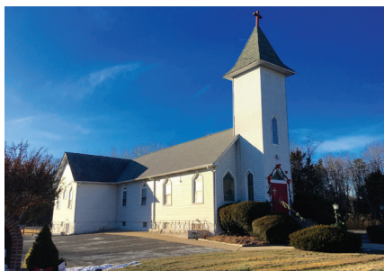
Sacred Heart Church

119 North Route 73 Cedar Brook, NJ 08018