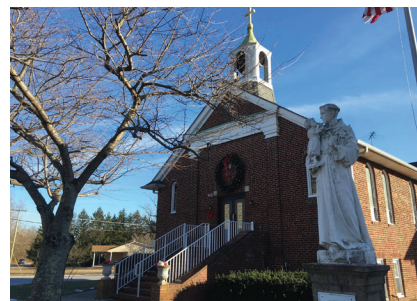
St. Anthony's Church

436 Pennington Avenue Waterford, NJ 08089