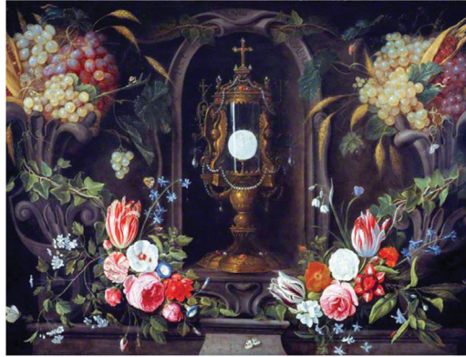
Jan van Kessel the Elder, "Still Life of Flowers and Grapes Encircling a Monstrance", ca. 1670