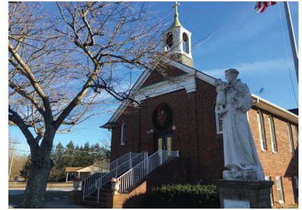
St. Anthony's Church

436 Pennington Avenue Waterford, NJ 08089