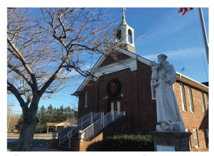
St. Anthony's Church

436 Pennington Avenue Waterford, NJ 08089