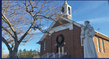
ST. ANTHONY CHURCH

318 Carl Hasselhan Drive • Atco, NJ 08004