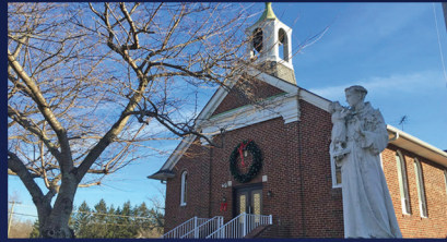
ST. ANTHONY CHURCH

318 Carl Hasselhan Drive • Atco, NJ 08004