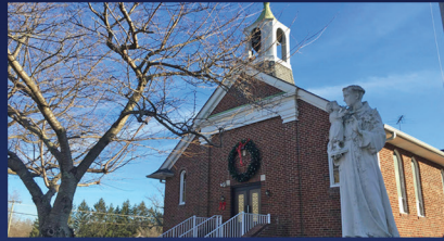
ST. ANTHONY CHURCH

318 Carl Hasselhan Drive • Atco, NJ 08004