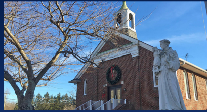
ST. ANTHONY CHURCH

318 Carl Hasselhan Drive • Atco, NJ 08004