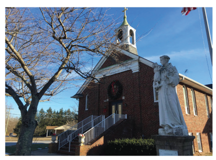
St. Anthony's Church

436 Pennington Avenue Waterford, NJ 08089