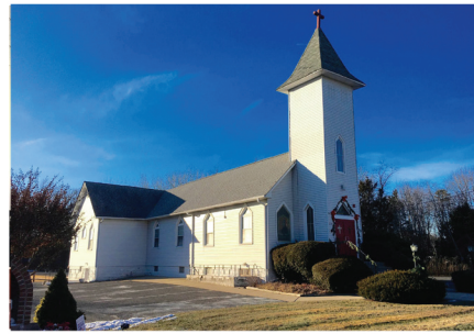
Sacred Heart Church

119 North Route 73 Cedar Brook, NJ 08018