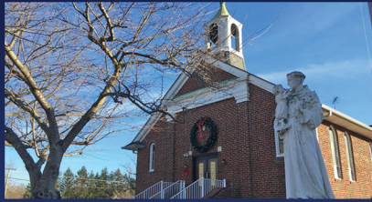
ST. ANTHONY CHURCH

318 Carl Hasselhan Drive • Atco, NJ 08004