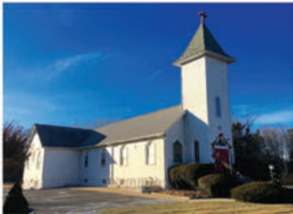
Sacred Heart Church