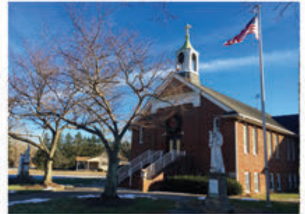
St. Anthony's Church

436 Pennington Avenue Waterford, NJ 08089